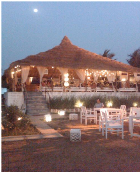
Evening view of restaurant